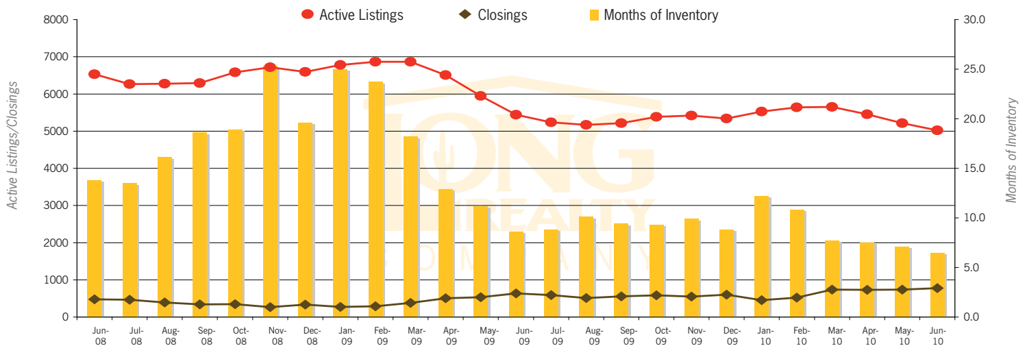
Months of Inventory, Active Listings and Closings

These statistics are based on information obtained from the ARMLS on 7/6/10 using Brokermetrics software. Information is believed to be reliable, but not guaranteed. Months of Inventory (MOI) reflect the time period required to sell all the properties on the market given the number of closed transactions in the preceding month, provided no new product becomes available. This is an excellent benchmark to show the velocity of transactions in relation to the market inventories. This measurement is a broad one and will vary (in some cases dramatically) by price range, location and type of property.