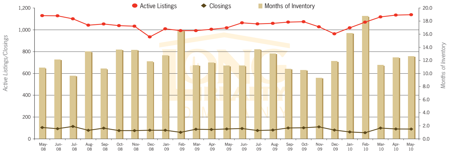
Months of Inventory, Active Listings and Closings

These statistics are based on information obtained from the Southeast Arizona MLS on 6/3/10. Information is believed to be reliable, but not guaranteed. Months of Inventory (MOI) reflect the time period required to sell all the properties on the market given the number of closed transactions in the preceding month, provided no new product becomes available. This is an excellent benchmark to show the velocity of transactions in relation to the market inventories. This measurement is a broad one and will vary (in some cases dramatically) by price range, location and type of property.